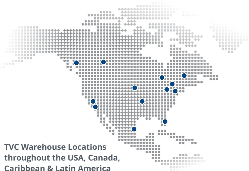
TVC Warehouse Locations throughout the USA, Canada, Caribbean & Latin America