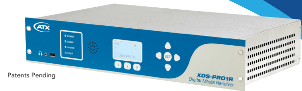
XDS-PRO1R (front view)