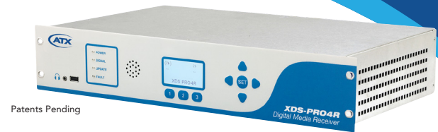
XDS-PRO4R (front view)