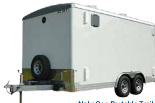
AlphaGen Portable Trailer