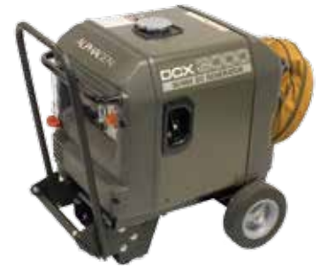
AlphaGen with optional wheel kit with locking handle and optional canvas cable bag