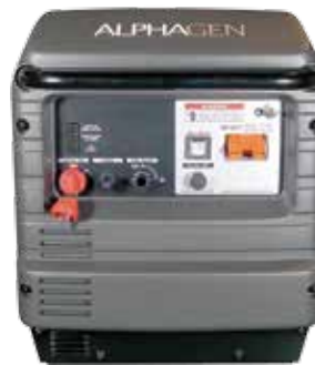
AlphaGen Front View