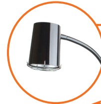
CL100 CORDED LIGHT WITH FLEX ARM