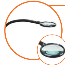
CL200 MAGNIFIER LENS WITH FLEX ARM