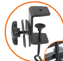
CL500 UNIVERSAL CABLE CLAMP