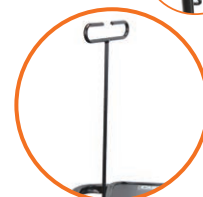
CTTB T-BAR FIXTURE