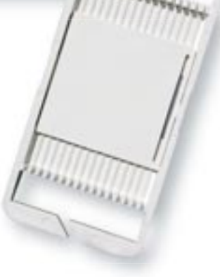
Single Fusion Holder